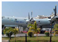
TU 142 Air Craft Museum