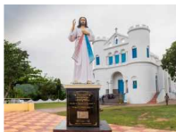
Ross Hill Church