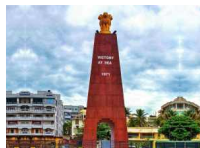
Victory at Sea War Memorial